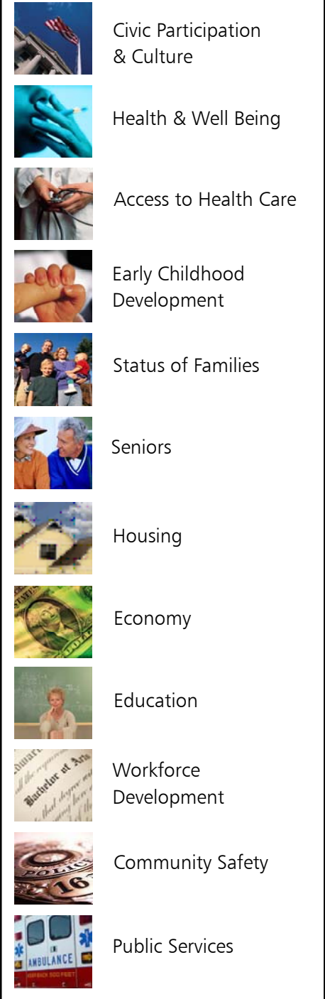
Jackson Community Report Card Table of Contents

Once the desired sections and topics were chosen, Perspectives developed a 75 question customized survey. The Community Survey was conducted with 500 county residents to give an accurate representation of the county. Perspectives also gathered extensive data from agencies across the county which included performance data, service-level data, benchmarking data and data from previous studies. The survey research and findings were incorporated with the secondary data to fulfill the Human Services Coordinating Alliance's goal for a comprehensive view of the community from all angles.