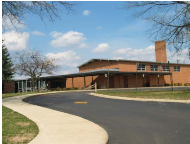
Lakeview High School • Battle Creek, Michigan

"Lakeview School District has used this information to focus communication goals and messages and therefore use their resources more efficiently. "